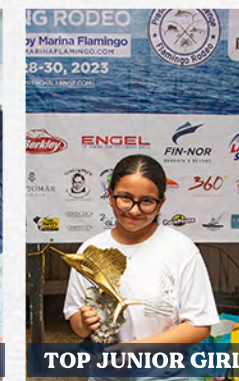
TOP JUNIOR GIRL