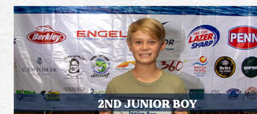
2ND JUNIOR BOY