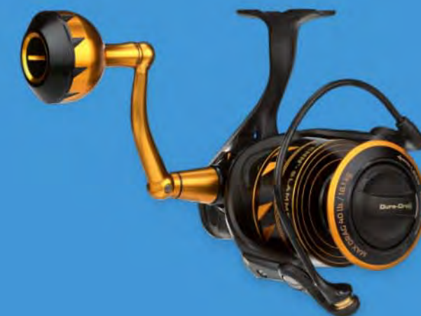
PENN® Slammer® IV

WHEN FISHING SHALLOWS, YOU NEED A REEL WITH A REPUTATION THAT RUNS DEEP.